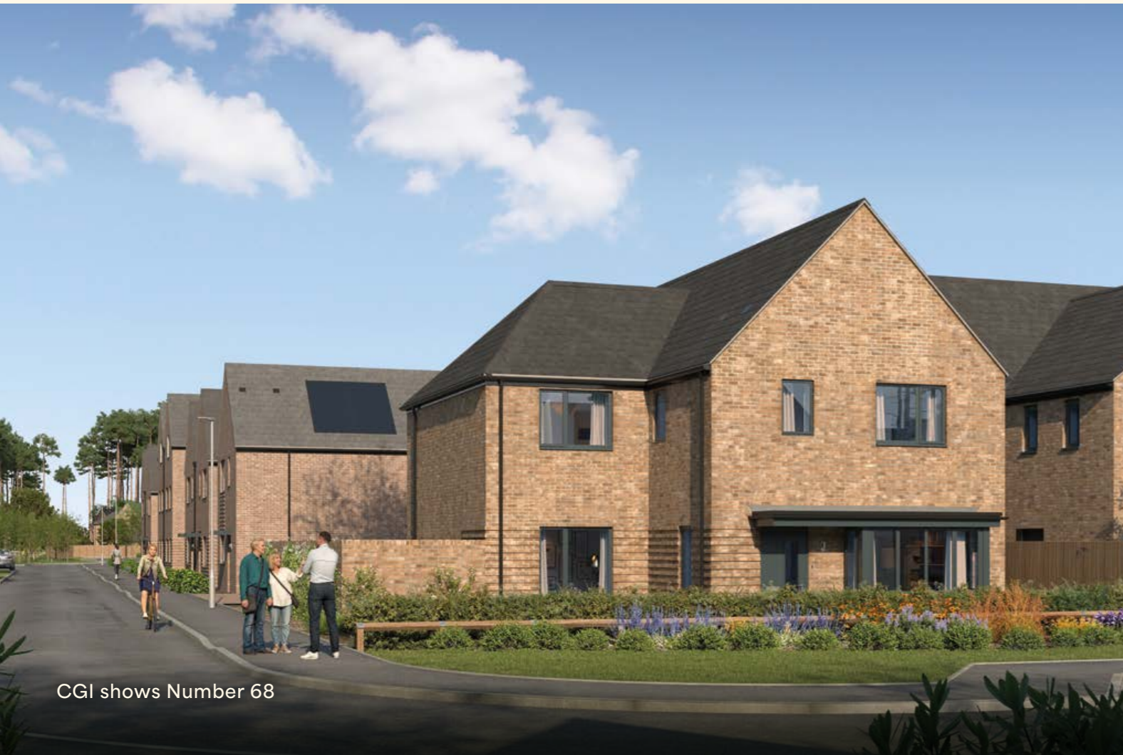
CGI shows Number 68

Total Approx Internal Area: 157.87 Sq. m. / 1699.2 Sq. ft.