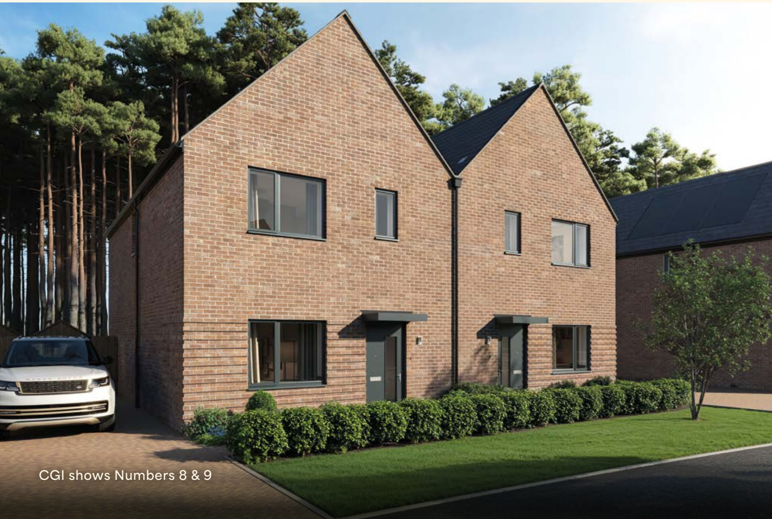
CGI shows Numbers 8 & 9

Total Approx Internal Area: 103.95 Sq. m. / 1118.9 Sq. ft.