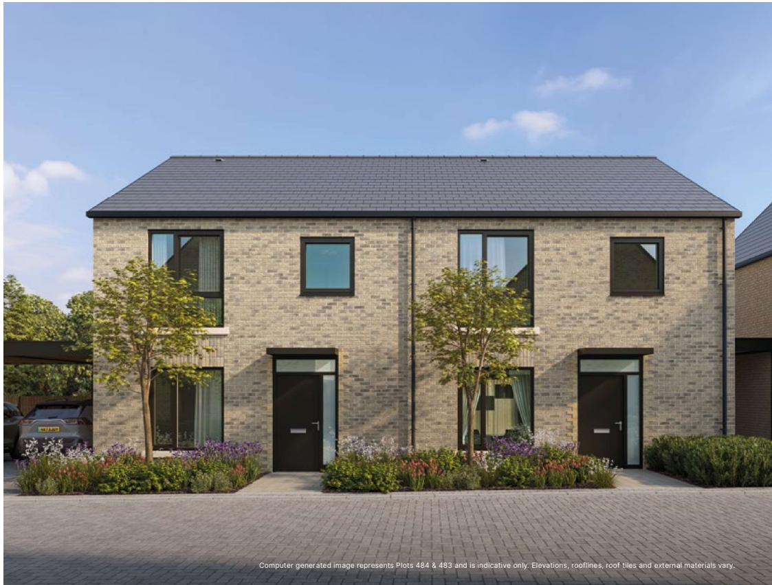
Computer generated image represents Plots 484 & 483 and is indicative only. Elevations, rooflines, roof tiles and external materials vary.