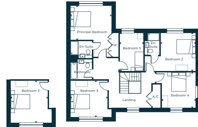
Bedroom 3 overhang difference to Plots 11 & 34 only