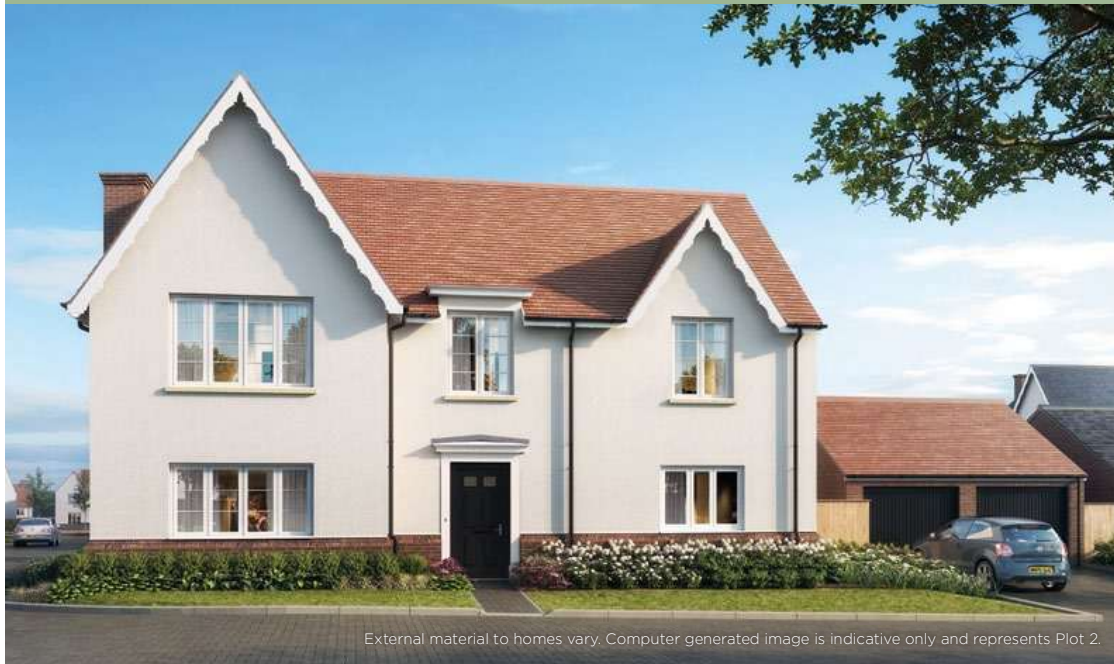
External material to homes vary. Computer generated image is indicative only and represents Plot 2.

5 BEDROOM HOUSE PLOTS 2, 3, 9*, 11, 15 & 34