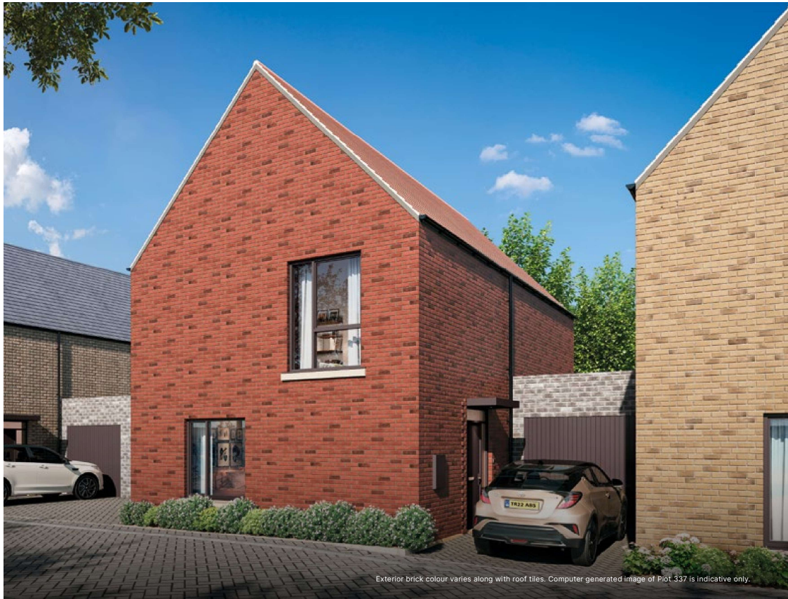
Exterior brick colour varies along with roof tiles. Computer generated image of Plot 337 is indicative only.