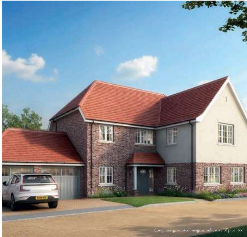
Computer generated image is indicative of plot 160.