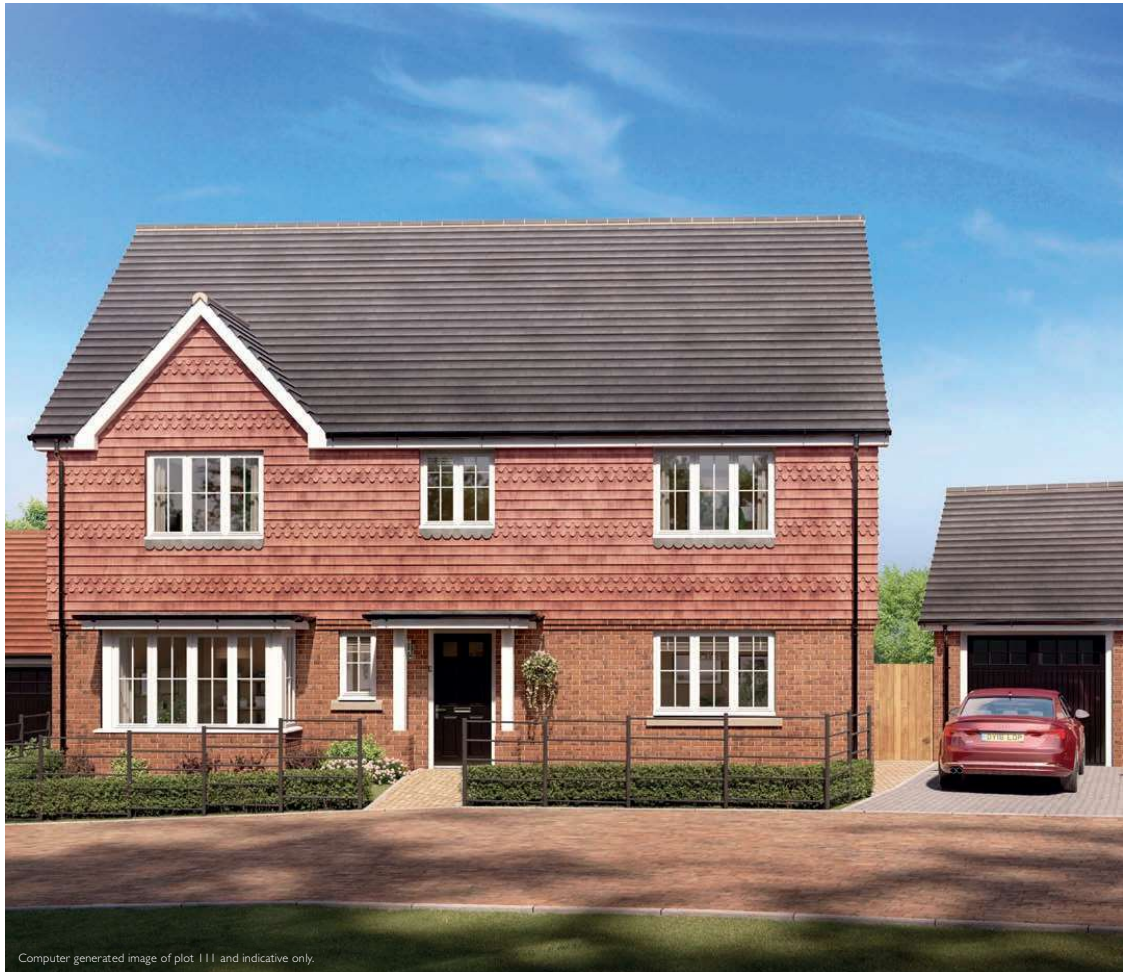
Computer generated image of plot 111 and indicative only.