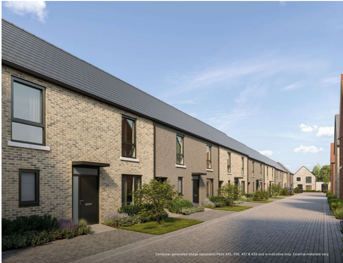
Computer generated image represents Plots 455, 456, 457 & 458 and is indicative only. External materials vary.