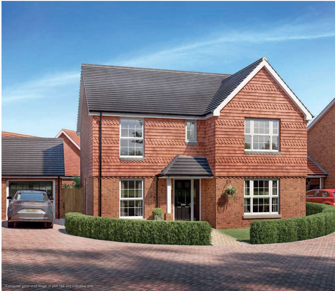
Computer generated image of plot 166 and indicative only.