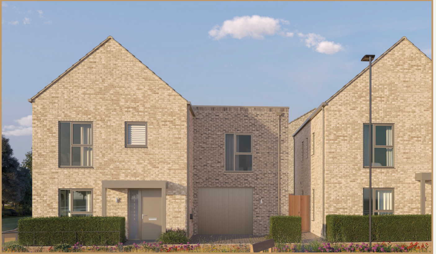
Computer generated image is indicative only and represents The Cromwell.