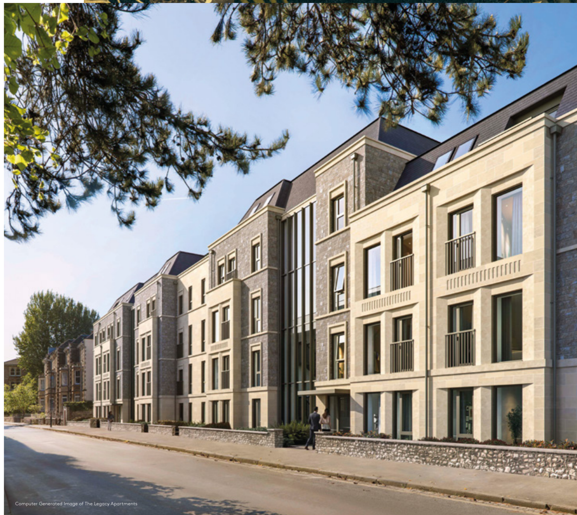
Computer Generated Image of The Legacy Apartments

With no need for costly refurbishments and worry free maintenance with a 10-year NHBC warranty, a new home at The Clifton Collection is built ready for the future.