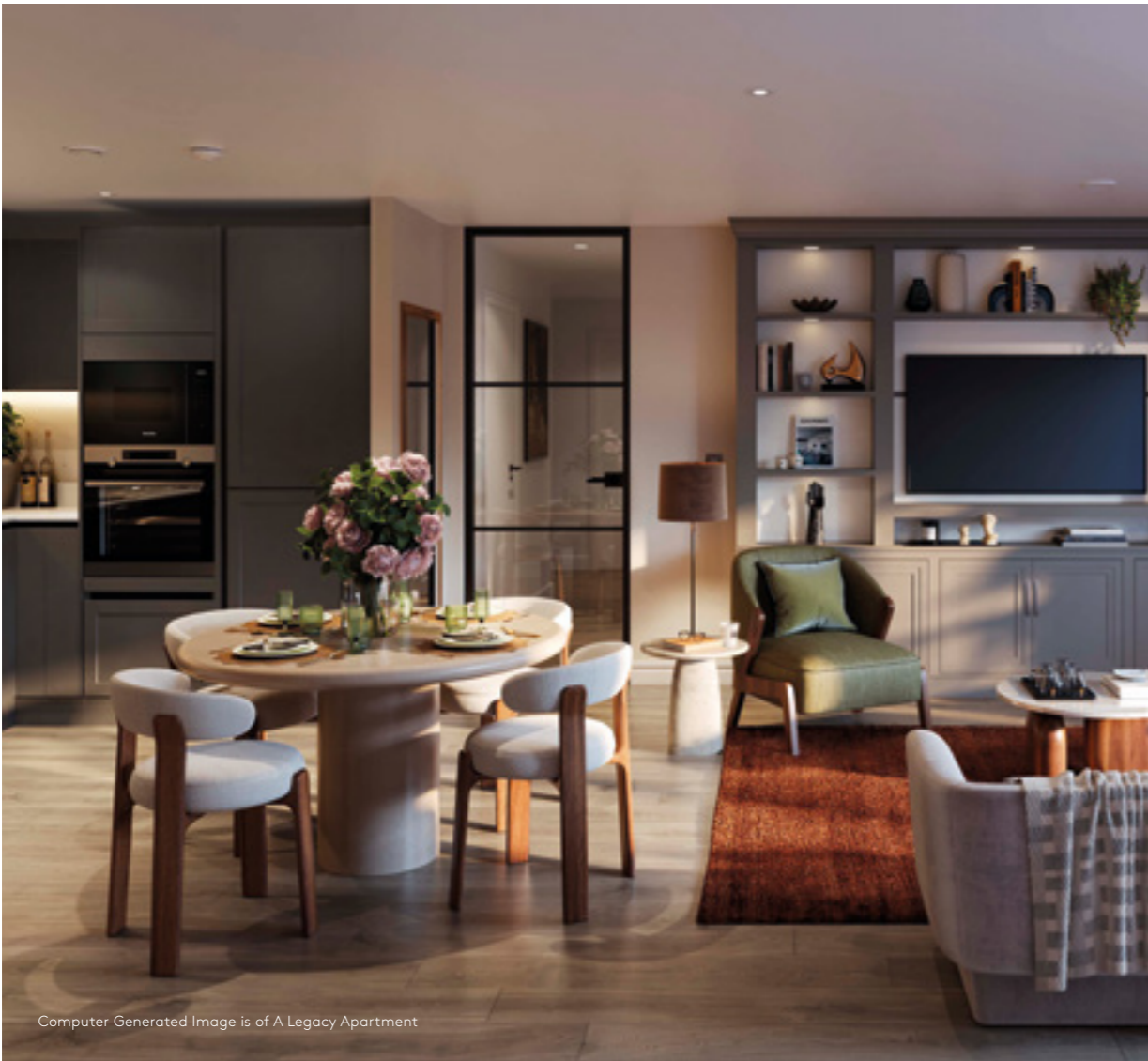
Computer Generated Image is of A Legacy Apartment