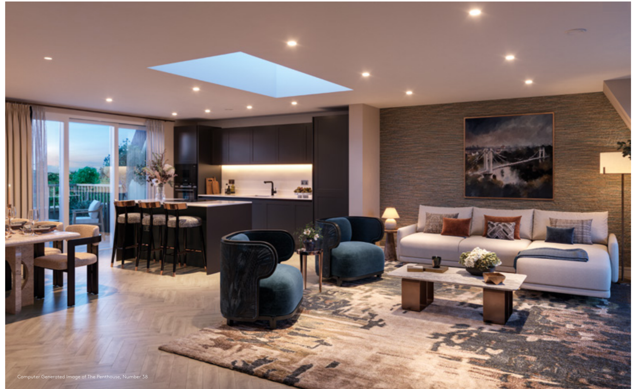
Computer Generated Image of The Penthouse, Number 38

Bathrooms and en-suites are finished with large format porcelain tiling, matt black brassware, contemporary white sanitaryware, and LED lit mirrored cabinets for a refined touch.