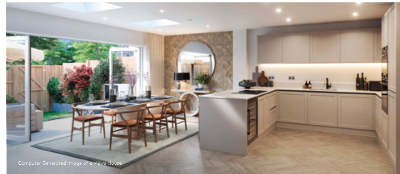
Computer Generated Image of a Mews House

Generously sized windows flood each home with natural light, enhancing the sense of space and providing a seamless connection throughout the home.