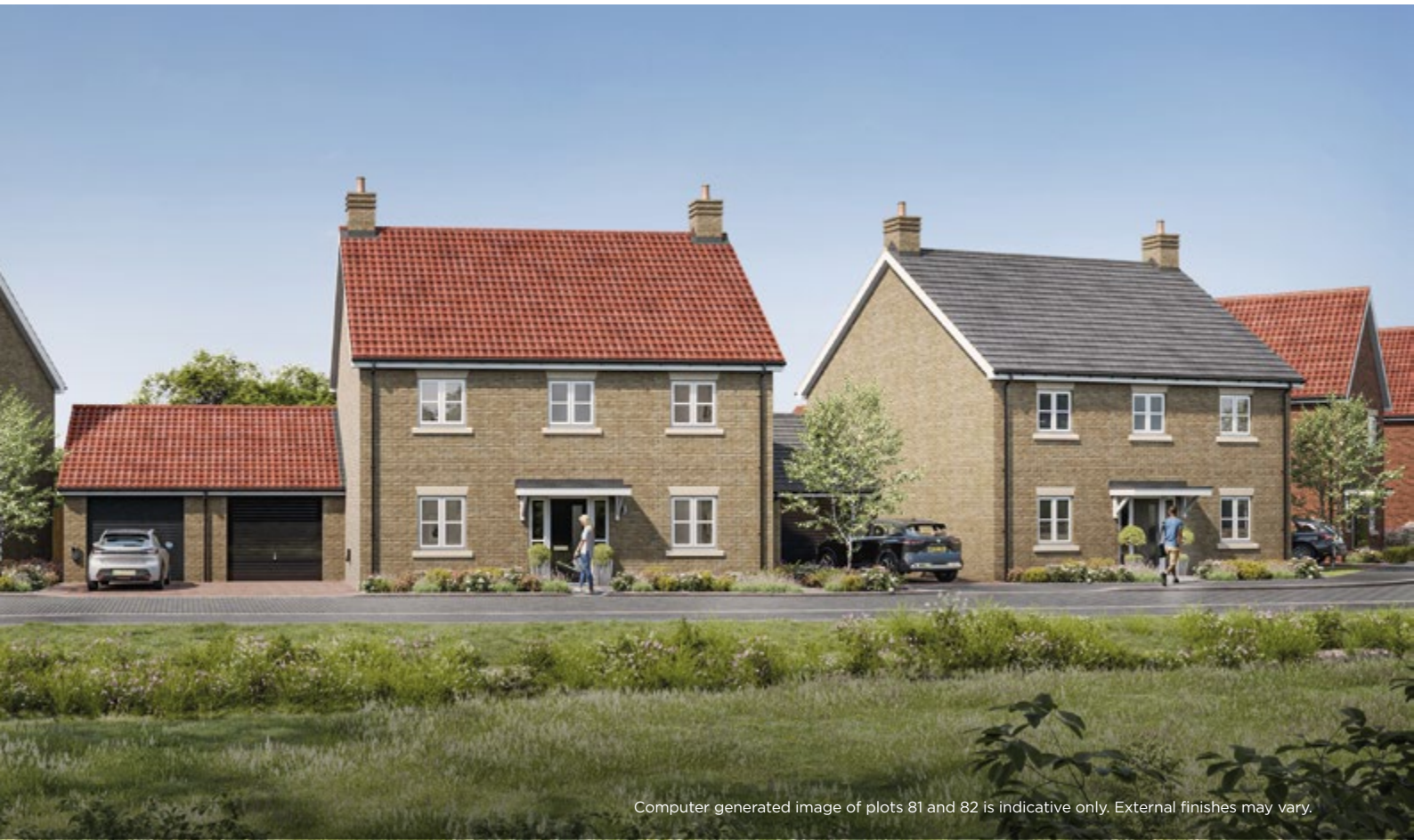
Computer generated image of plots 81 and 82 is indicative only. External finishes may vary.

4 BEDROOM HOUSE PLOTS 81, 82*, 83* 96*, 97 & 107