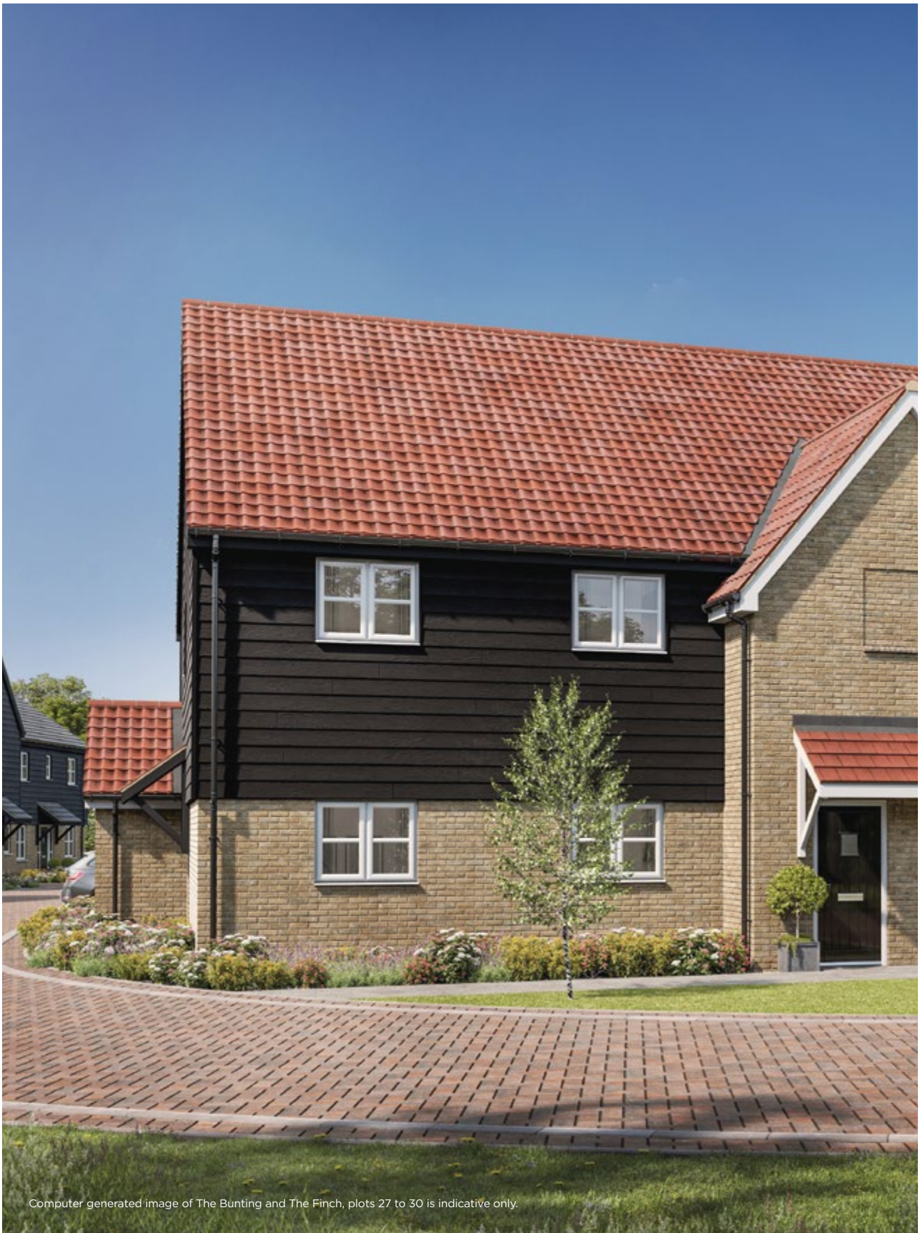
Computer generated image of The Bunting and The Finch, plots 27 to 30 is indicative only.

W - WARDROBE US - UTILITY STORE [---] - INDICATIVE WARDROBE POSITION