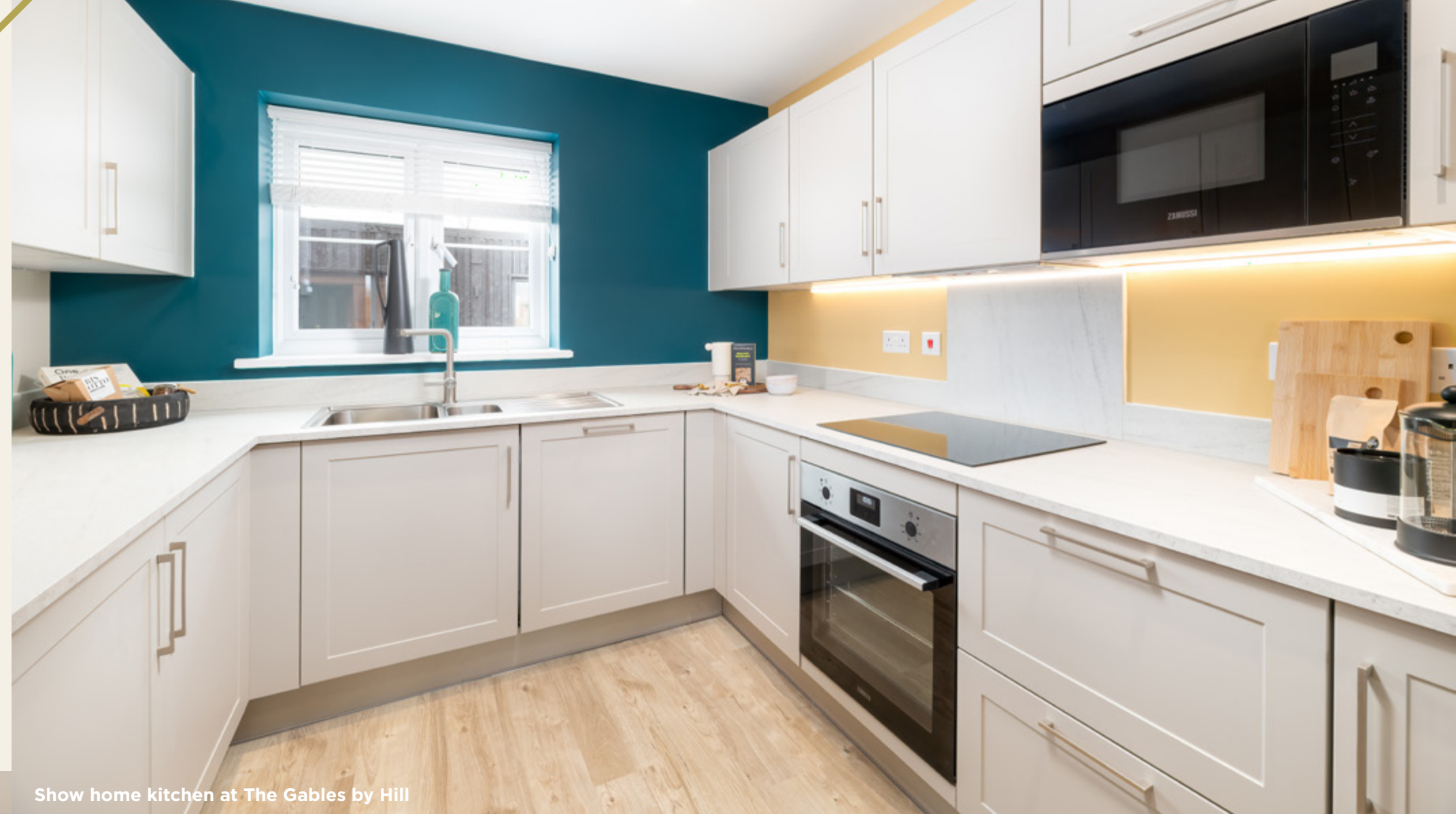
Show home kitchen at The Gables by Hill

† These are regulated energy costs as estimated based on EPC performance data. www.hbf.co.uk