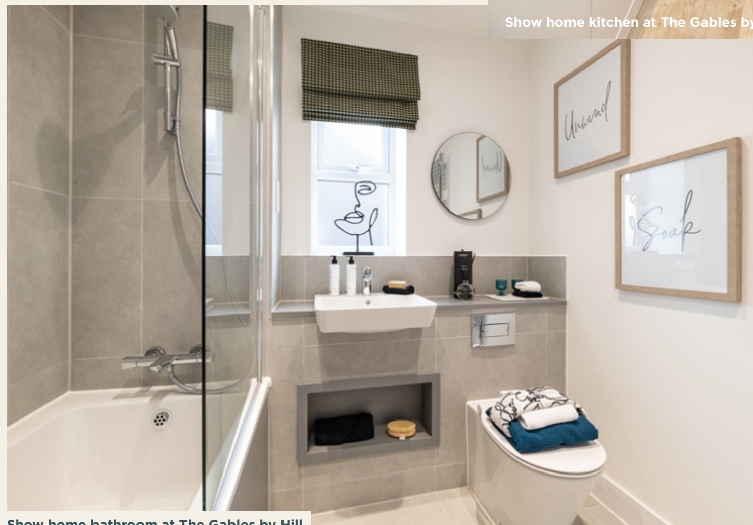
Show home bathroom at The Gables by Hill