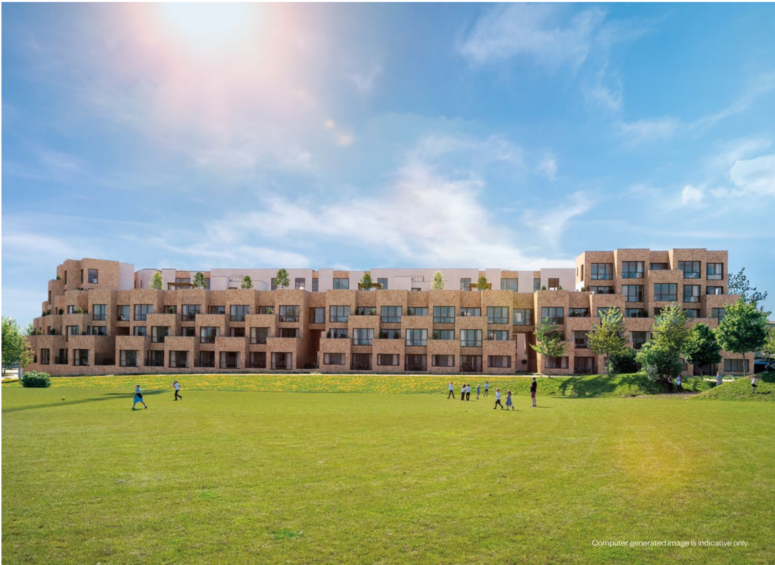
Computer generated image is indicative only.

◄► = Measurements C = Cupboard W = Wardrobe U/S = Utility/Store cupboard W/D = Washer/Dryer HR = MVHR R = Riser cupboard □ = Indicative wardrobe position