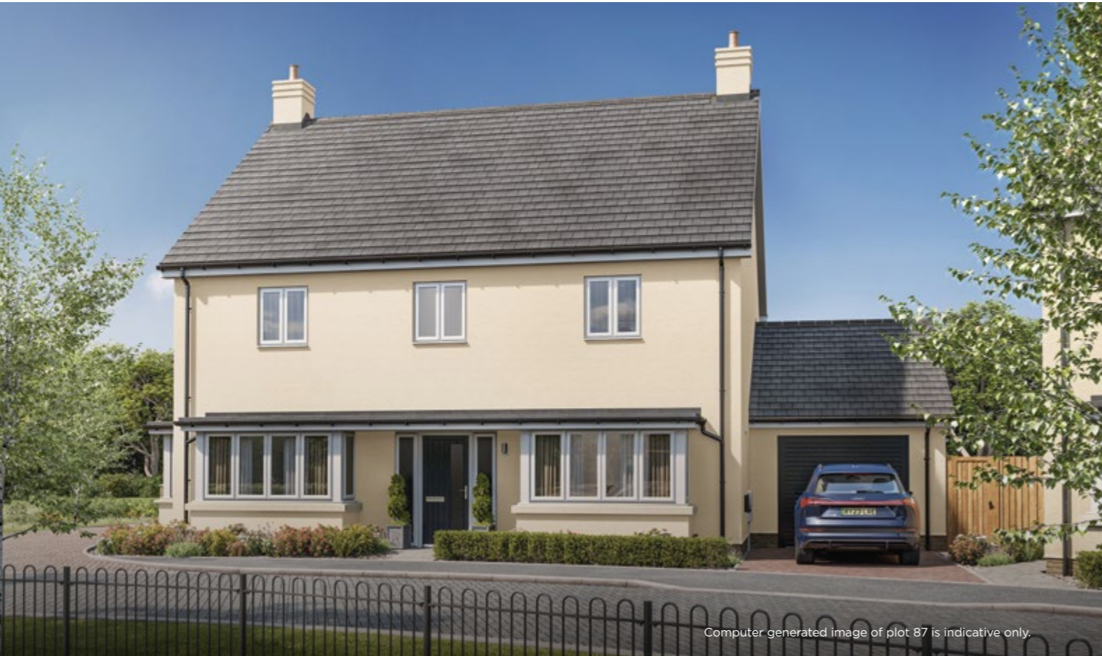
Computer generated image of plot 87 is indicative only.