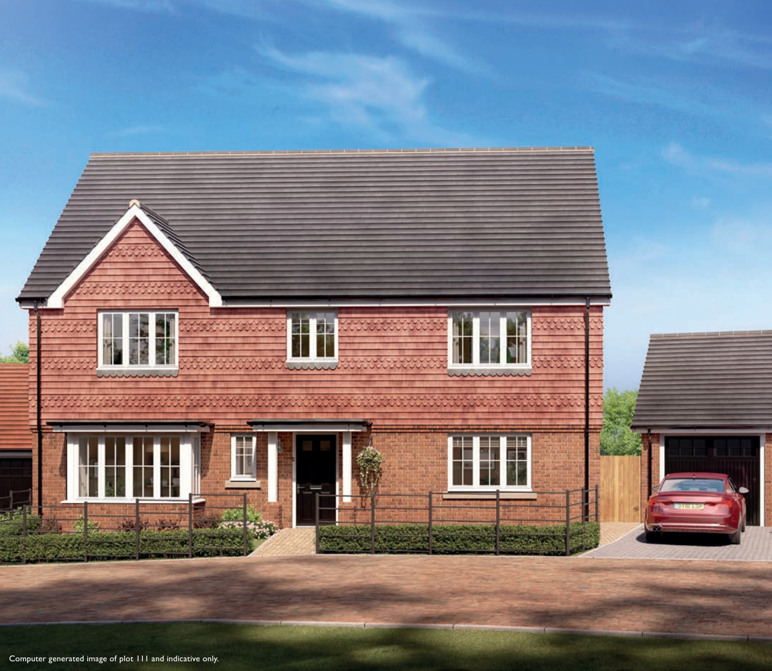
Computer generated image of plot 111 and indicative only.