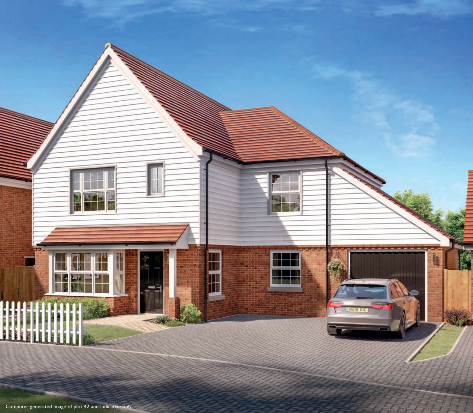
Computer generated image of plot 42 and indicative only.