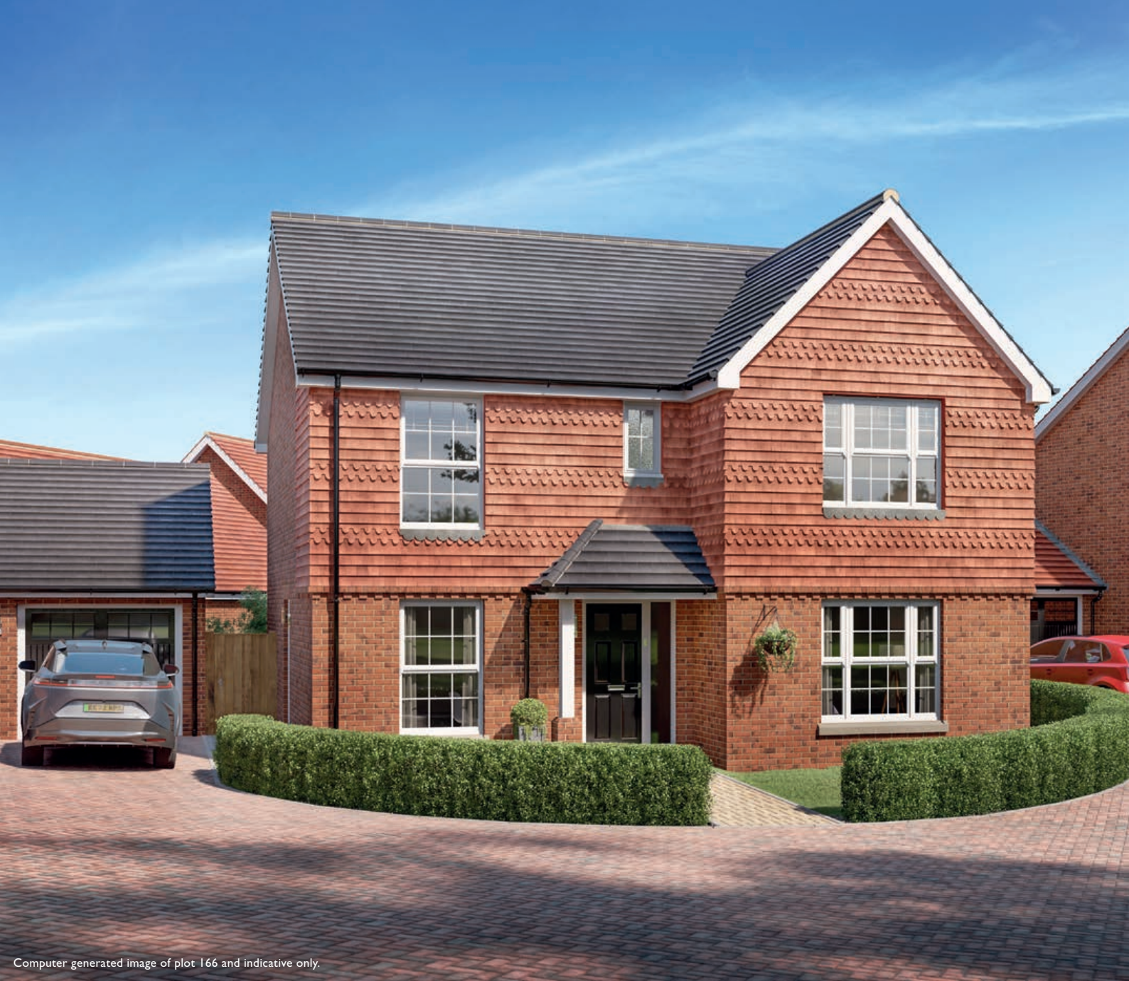
Computer generated image of plot 166 and indicative only.