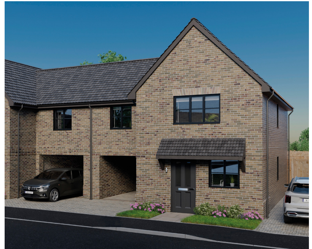
Exterior finishes may vary, speak to the sales team for more information. Computer generated image of plot 60 The Glaven is indicative only.