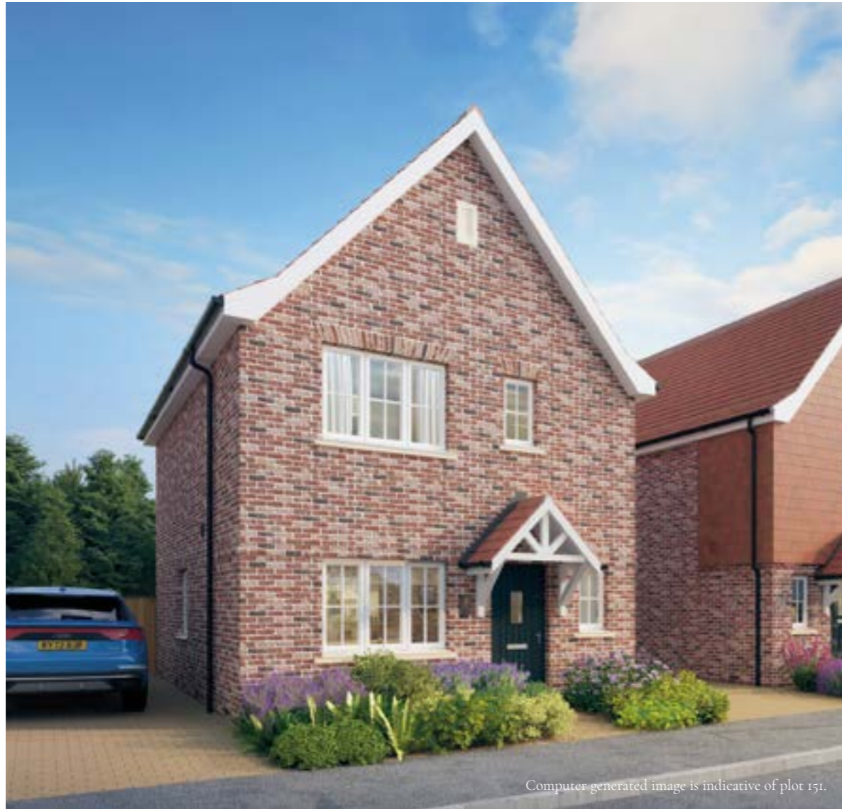
Computer generated image is indicative of plot 151.