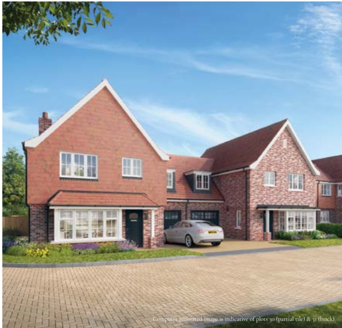
Computer generated image is indicative of plots 30 (partial tile) & 31 (brick).