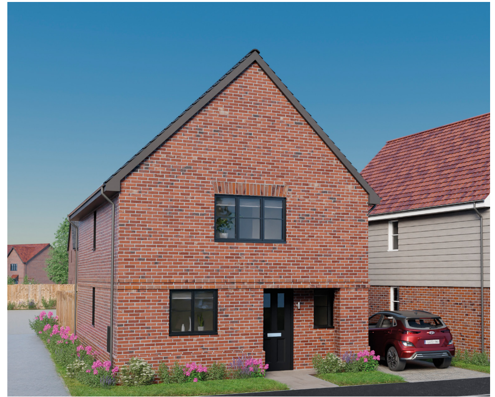
Exterior finishes may vary, speak to the sales team for more information. Computer generated image of plot 69 The Panford is indicative only.