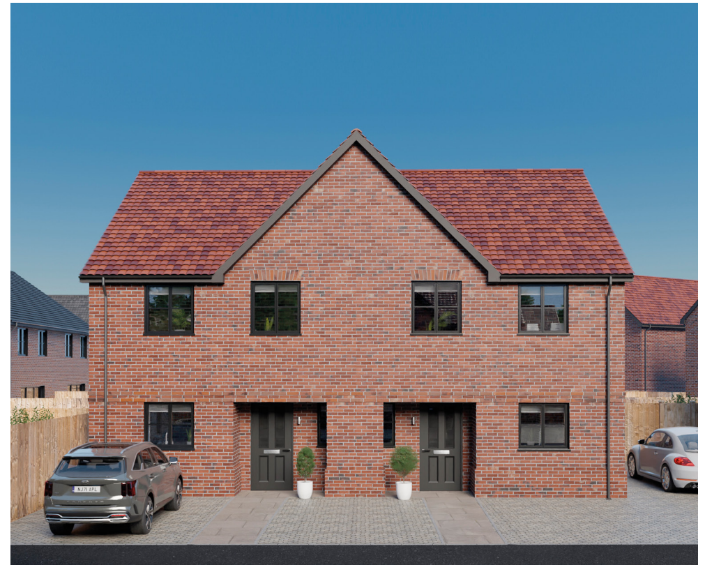
Exterior finishes may vary, speak to the sales team for more information. Computer generated image of plots 80 & 81 The Bure is indicative only.