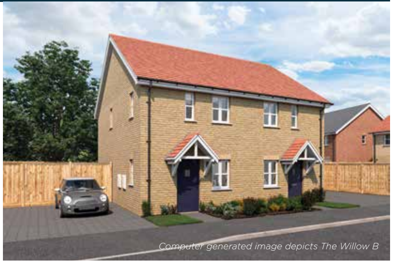
Computer generated image depicts The Willow B