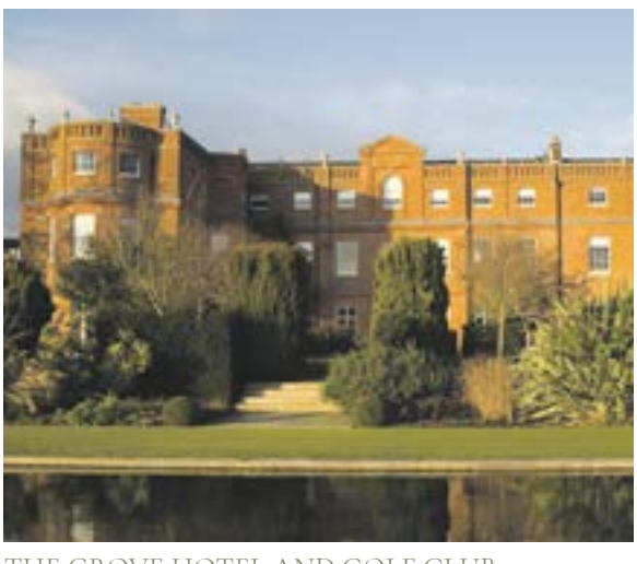
THE GROVE HOTEL AND GOLF CLUB

Battlers Green Farm is a rural shopping village, set on a pretty, working farm, offering a truly unique shopping experience. Battlers Green Farm Shop stocks high-quality food and wine, and hosts over 20 shops, including Osprey London, a florist, a butcher, a fishmonger and even a salon and spa. The perfect place to while away a lazy Sunday afternoon.