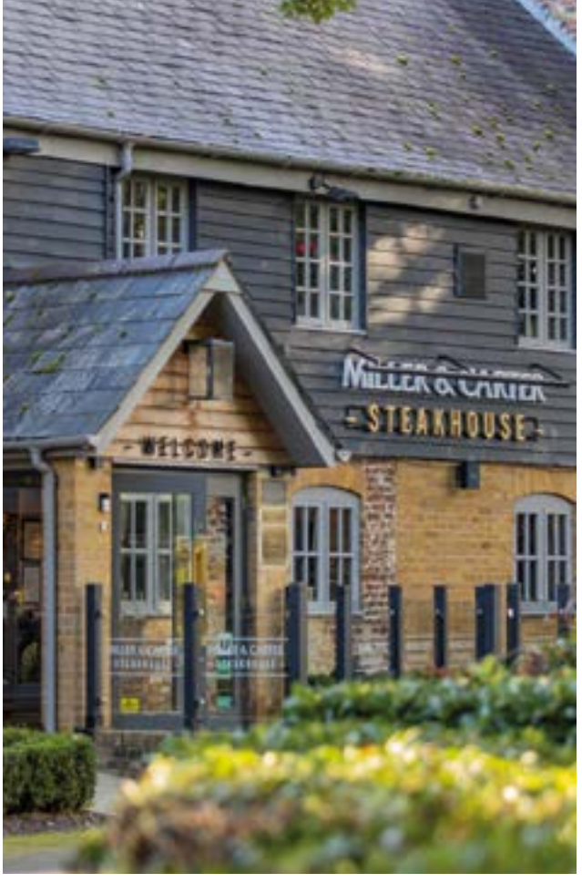
MILLER & CARTER

Prime Steak & Grill is an upmarket steakhouse. Their menu offers 'New York steakhouse flair with a British twist'. Not only renowned for its use of high-quality produce, but also its vast cocktail list which offers classics and specialities, alongside curated wines and spirits. Prime Steak & Grill is the perfect place to celebrate a special occasion.