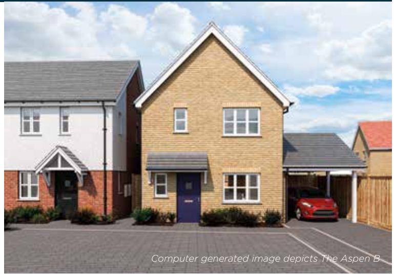
Computer generated image depicts The Aspen B