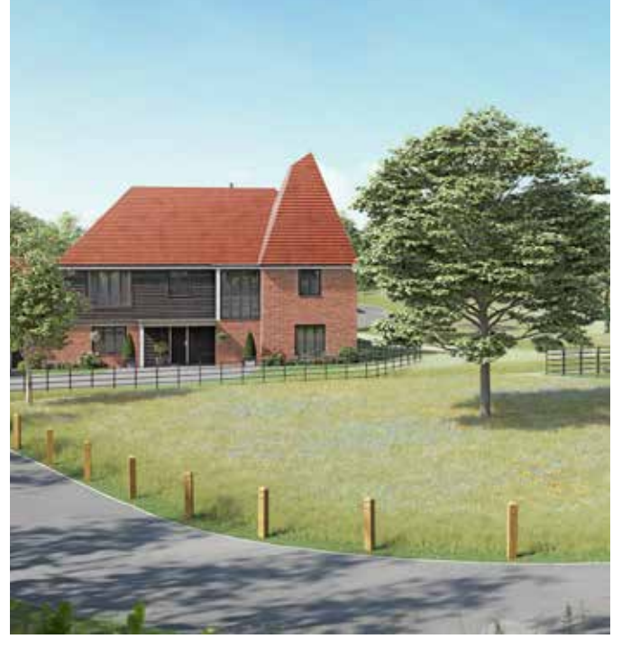
HARTLEY ACRES Cranbrook, Kent Hill Residential 117 homes, no commercial space Under construction

OXFORD NORTH Oxford Working with Thomas White Oxford 317 new homes; 2,500 sq m commercial space Under construction