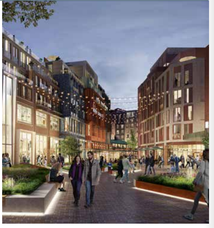
CITY CENTRE SOUTH Coventry Partnership with Shearer Property Group 1,500 new homes; 70,000 sq m commercial space Starting on site in 2023