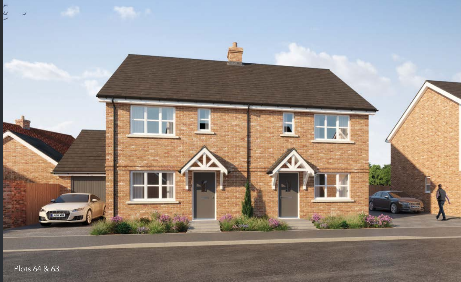
Plots 64 & 63