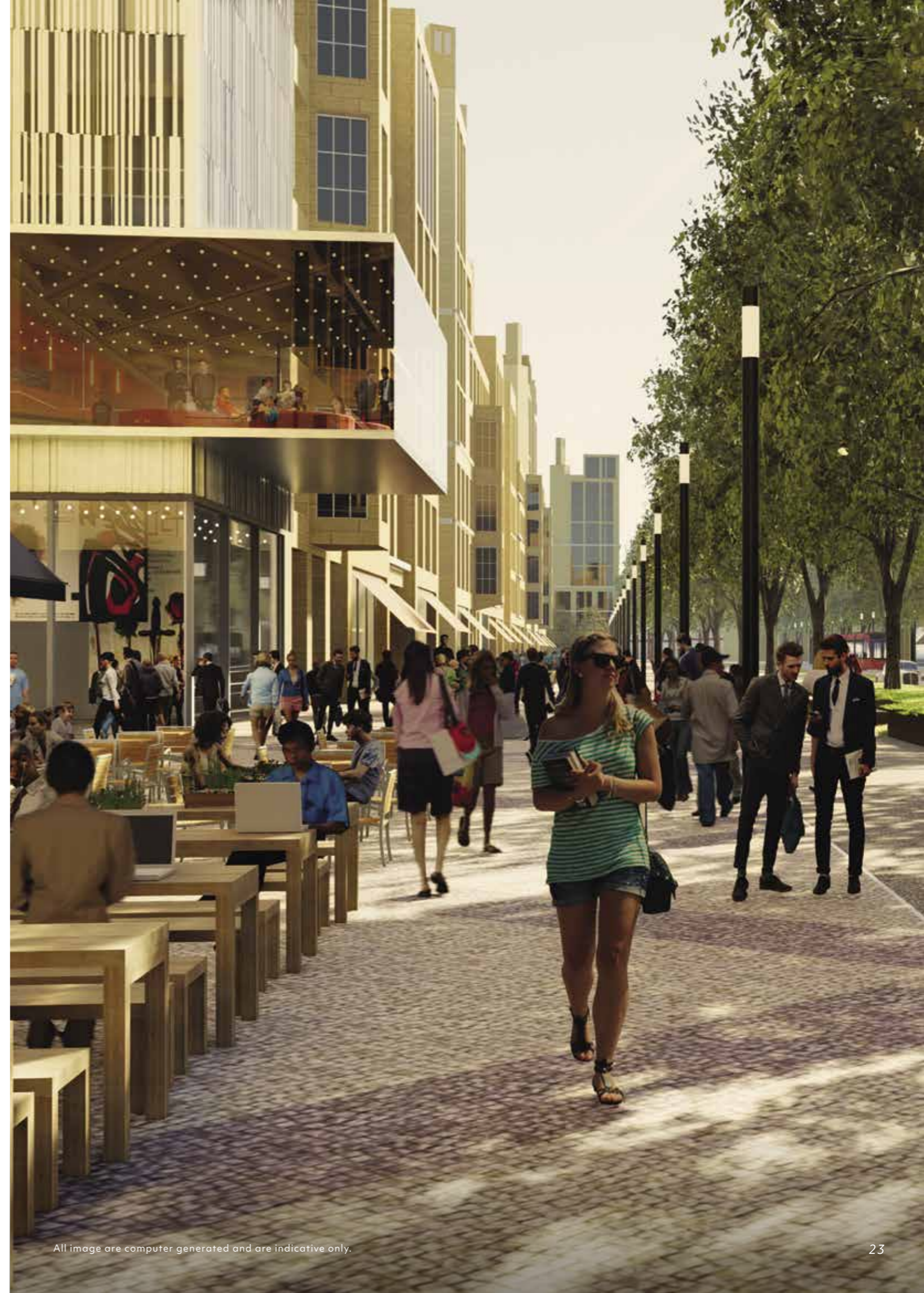
All image are computer generated and are indicative only.