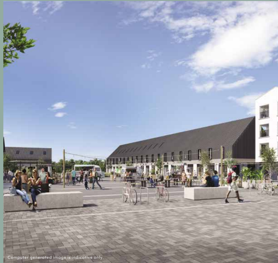
Computer generated image is indicative only.

CB5 will soon become synonymous with a lifestyle steeped in health and wellbeing and with so much planned for this expanding neighbourhood, Marleigh is the first chapter in this new community.