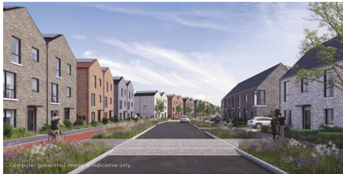
Computer generated image is indicative only.

With its excellent facilities, beautiful outside space and high quality design, Marleigh will be a place to feel proud of. This new place will be a gateway to the city and has been designed with the future in mind. It's not just a neighbourhood that will be enjoyed today - it's a neighbourhood that's built for future generations.