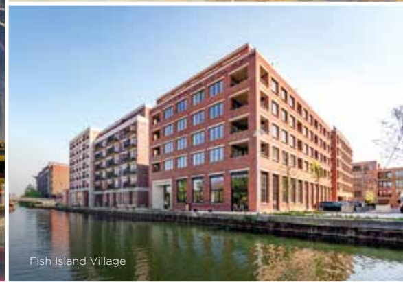
Fish Island Village

HILL IS AN AWARD-WINNING HOUSEBUILDER AND ONE OF THE LEADING DEVELOPERS IN LONDON AND THE SOUTH EAST OF ENGLAND, DELIVERING BOTH PRIVATE FOR SALE AND AFFORDABLE HOMES.