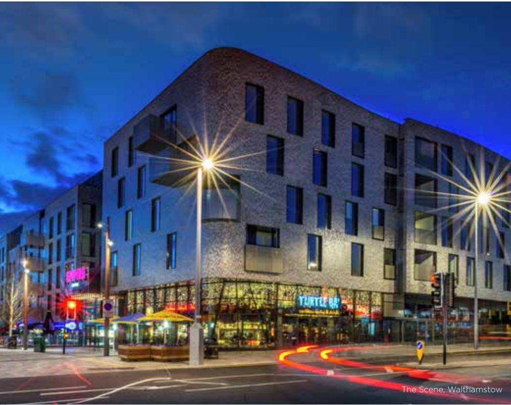
The Scene, Walthamstow