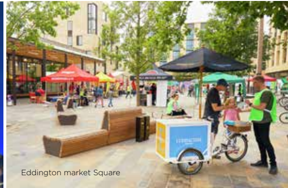
Eddington market Square